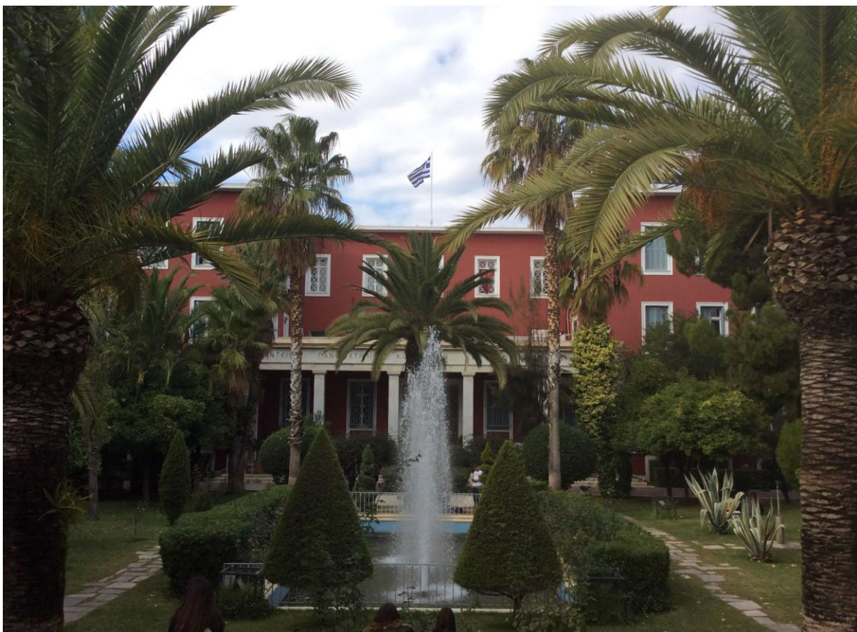
Panteion University of Social & Political Sciences